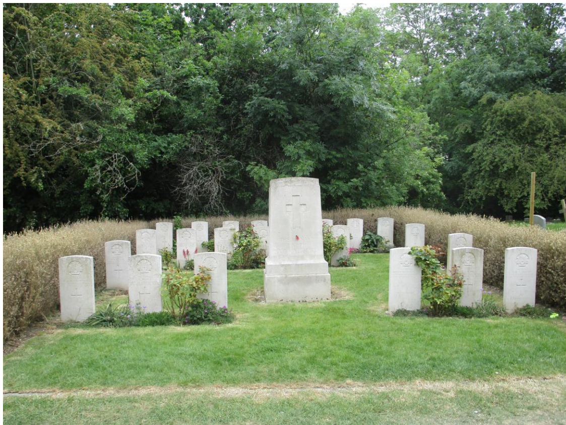
Australian War Graves in All Saints Cemetery, Nunhead